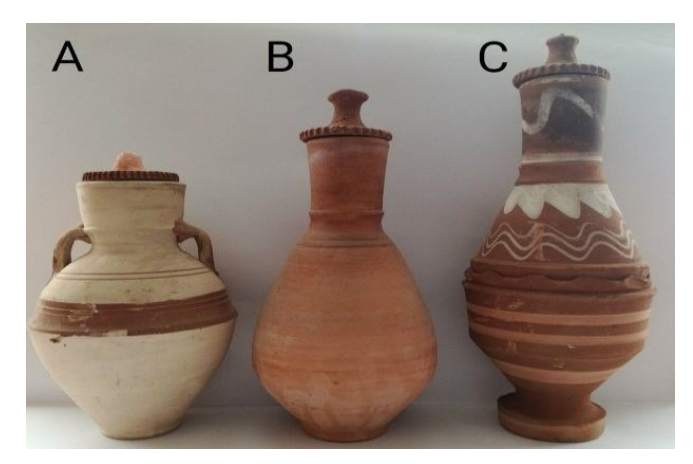
Fig. 2: Pottery jug (A), four of it purchased from Damietta Governorate; pottery jug (B) four of it purchased from El-Gharbia Governorate and Pottery jug (C), four of it purchased from El-Menya Governorate.